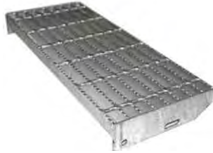
T2 Bolted Fixing - no nosing