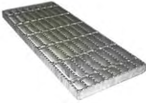
T1 Welding Fixing - no nosing