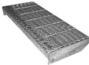
T4 Bolted Fixing - floor plate nosing