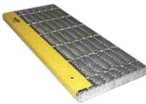
T5 Welding Fixing - abrasive nosing