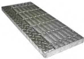
T3 Welding Fixing - floor plate nosing