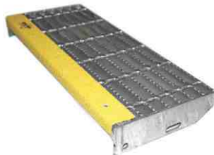
T6 Bolted Fixing - abrasive nosing